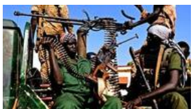
South Sudan ponders the future after ethnic killings