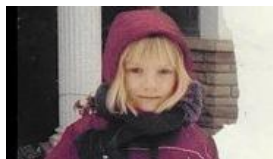
DOCUMENTARIES: 10 best of 2013, and a new crop in 2014