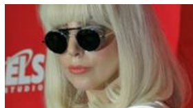
SXSW: Watch Coldplay, Damon Albarn, Lady Gaga and more online

The South by Southwest Film Conference and Festival announced its jury awards on Tuesday night in a ceremony at the Paramount Theater in Austin, Texas.