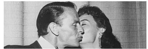
The Academy Awards through the years.