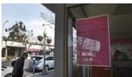
Is Palisades about to lose 'Mayberry with money' vibe?