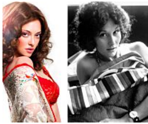
10 Actors And The Real Life People They Played USA Herald