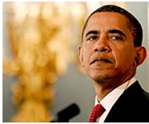
50% Stock Market Collapse Looming (Prepare!) Newsmax