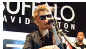
Photos: South by Southwest 2014