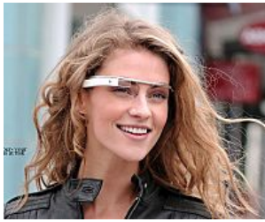
"The smartest $50 I ever spent was investing in Google shares". All it takes is $50 and 3 minute... eToro