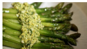
Photos: Recipes for asparagus