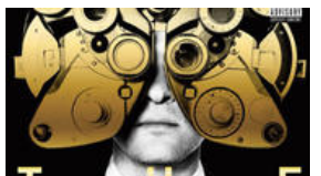
Top 10 downloaded albums of all time