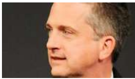
SXSW festival to add sports programming