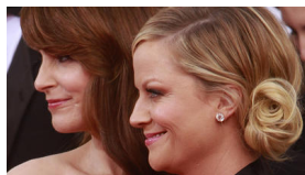
ENVELOPE: The latest awards buzz