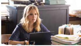
SXSW 2014: Five movie stories, including 'Chef' and 'Veronica Mars'