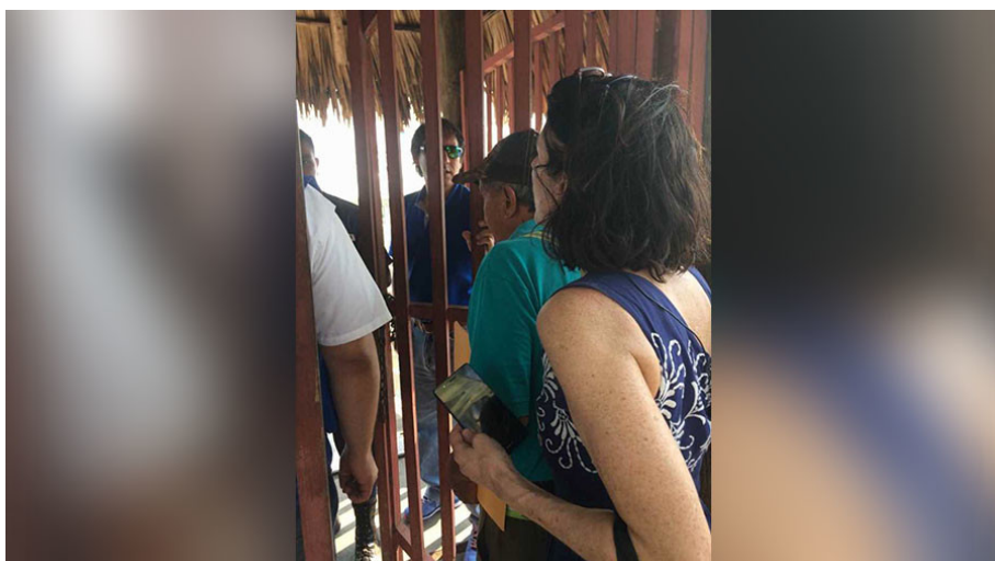
Women on Waves members denied entrance at the pier