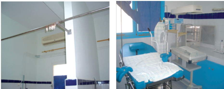
Figure 2: Delivery Room Renovations to Promote Privacy and Quality of Care

Sixteen maternity hospitals were renovated in 2008. In 2011, the program was expanded to other maternity hospitals and health center maternity units. The renovations of these facilities allowed women to receive 48 hours of post-partum care (which became mandatory) in acceptable living conditions. Facilities added reception and waiting areas, permitted family members to wait onsite, and greatly increased the privacy of delivery rooms.