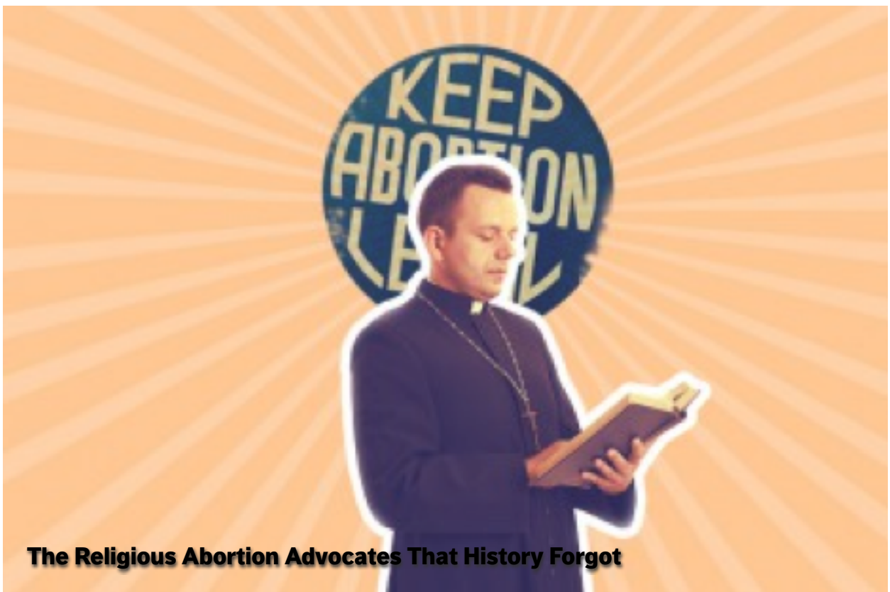
The Religious Abortion Advocates That History Forgot