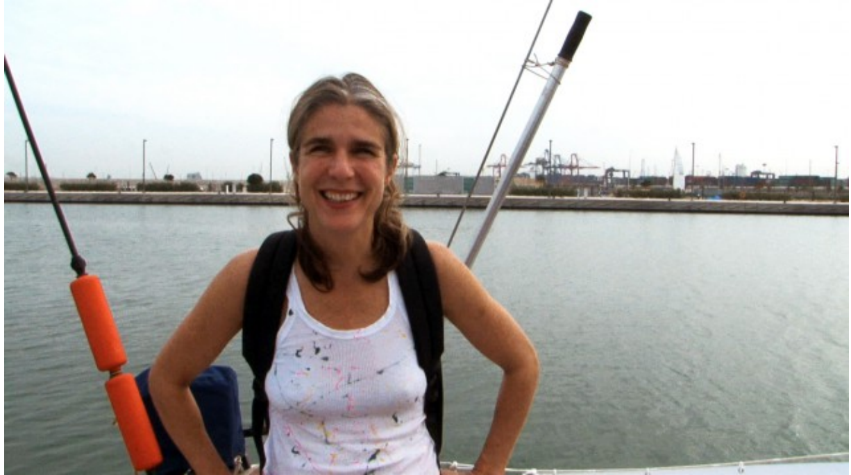
Dr. Rebecca Gomperts on her ship