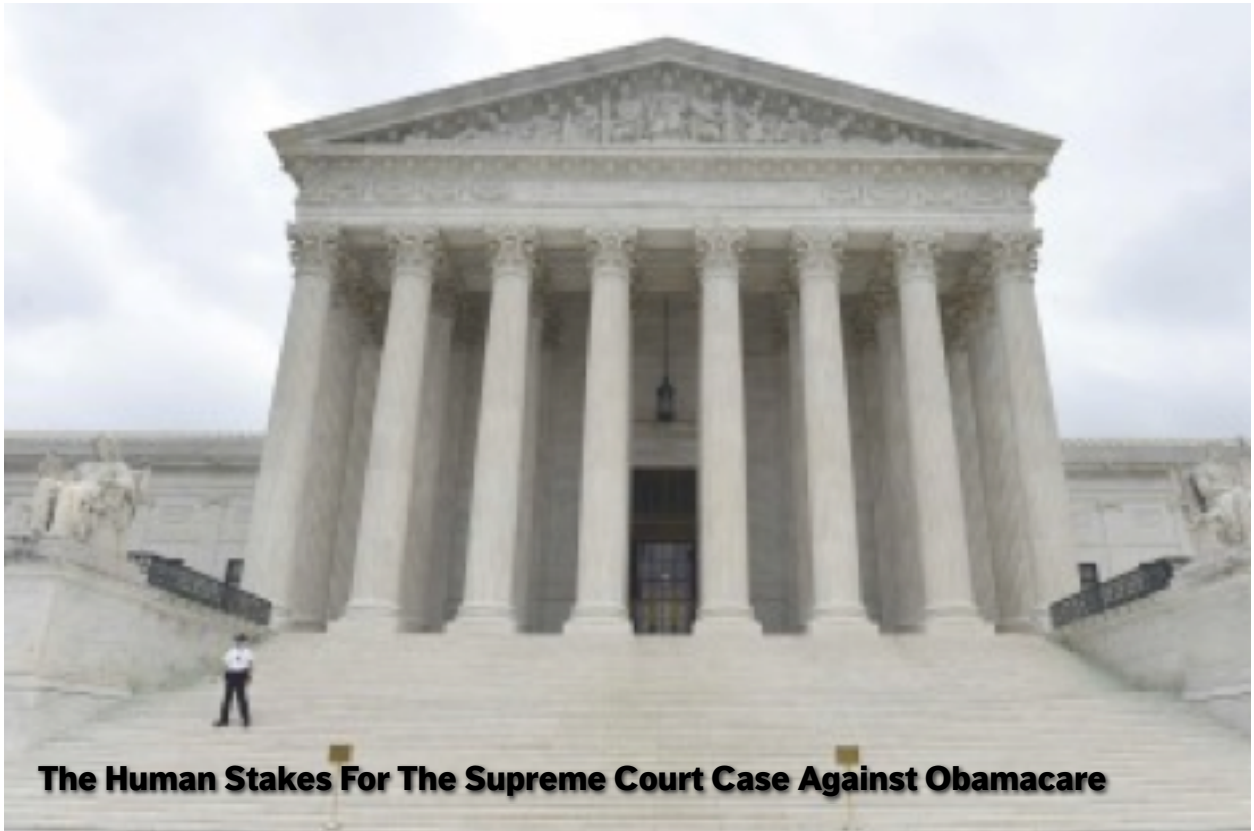
The Human Stakes For The Supreme Court Case Against Obamacare