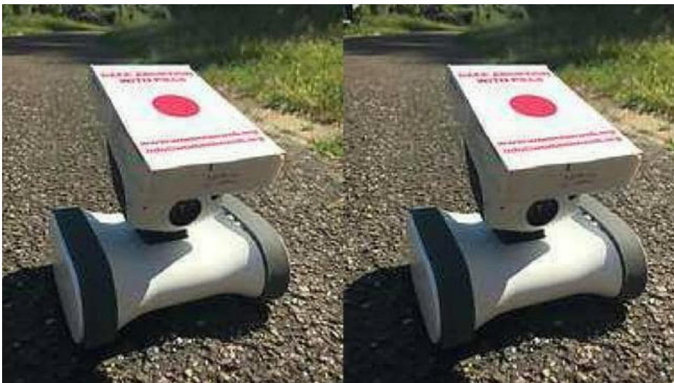
The robots being used to transport abortion pill to women in Northern Ireland.

In a statement, the groups claim this would not be breaking the country's law as the robots will be operated from the Netherlands. They add that, while technically taking abortion pills while pregnant is breaking the law, women cannot be forced to undergo pregnancy tests due to patient confidentiality. Plus, the Belfast city council passed a motion in April against the prosecution of women using abortion pills.