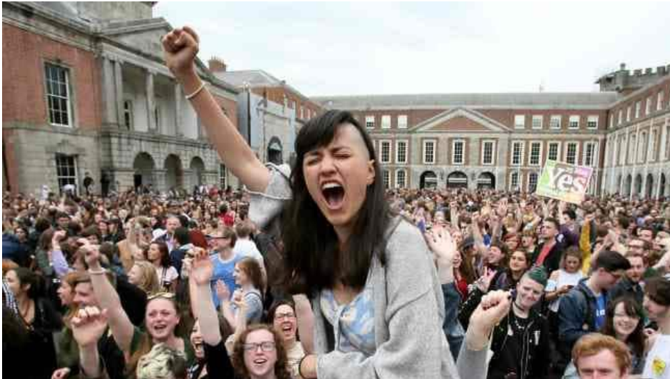
'Yes' campaigners celebrate the official result of the Irish abortion referendum.

where abortion is banned if the Irish parliament accepts the referendum.