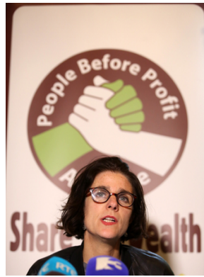
Dr Rebecca Gomperts