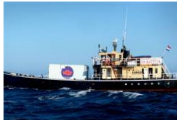
The Women on Waves boat

The abortion ship offers to use the abortion drug regimen called RU-486, a combination of Mifepristone and Misoprostol, for women with early term pregnancies. Women on Waves claims that according to international law, if the boat is outside a 12-mile radius from shore, Dutch law applies to the boat, allowing “medical” or chemical abortions on board.