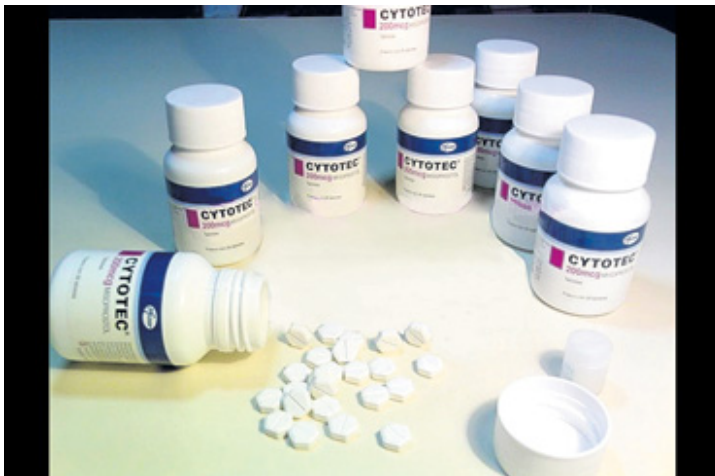
Bottles of the anti-ulcer drug Cytotec, which has gained popularity as an abortion pill and is sold without prescription on the local black market.

JAMAICAN women have been secretly using a drug intended to treat something completely different, to abort unwanted pregnancies without a doctor's prescription.