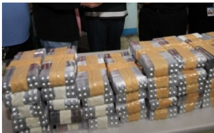
The packs seized from an Indian traveler containing 24,000 tablets of cytotec, a banned ulcer drug that has become popular for abortions, are laid out on a table at the NAIA.

July 22, 2014 7:49 AM