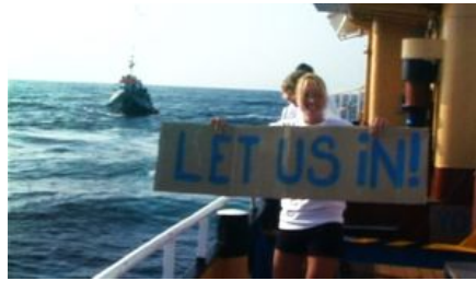
Women on Waves arrive in Portugal and ask to enter the port in 2006.