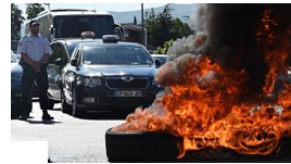
French government orders Uber taxi ban after protests