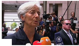
IMF's Christine Lagarde 'wants to restore stability' in Greece