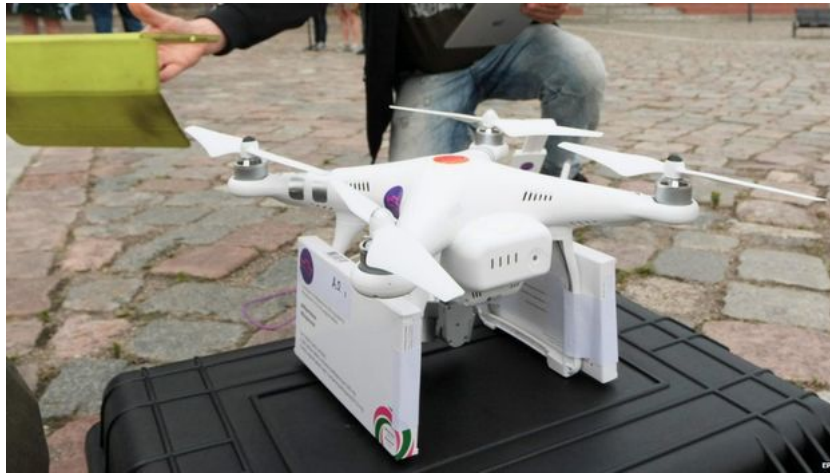
The packets of pills can be seen taped to the sides of the drone

"They pressed criminal charges but it is totally unclear on what grounds. The medicines were provided on prescription by a doctor and both Poland and Germany are part of Schengen" - the zone of 26 European countries within which internal borders have been abolished.