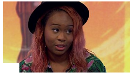
Sexting: 'Why I sent semi-naked photo of myself'