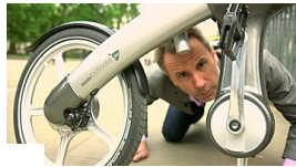
The e-bike without a chain