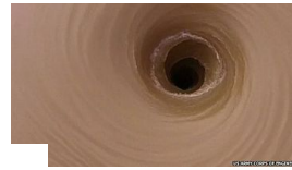
Vortex in Lake Texoma 'could swallow small boat'