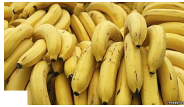
Portsoy village bans bananas to keep sailors happy