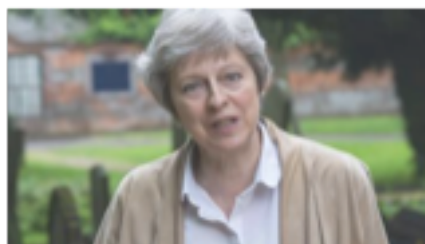
THERESA MAY FACES PROSPECT OF GOVERNMENT RIFT OVER CALLS TO SCRAP NORTHERN IRELAND ABORTION BAN May 27, 2018