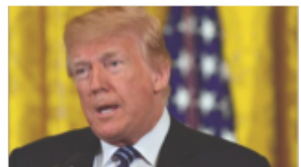
HOW ANTI-ABORTION FORCES LEARNED TO LOVE TRUMP May 22, 2018 In "Politics"