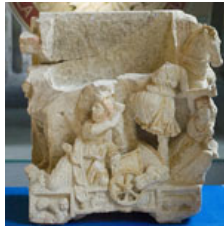
Looted Etruscan Artifacts Are Prize Objects