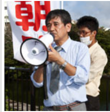
Serious Talk of Break From Japan in Okinawa