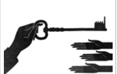
Op-Ed: The Legacy of the Boomer Boss