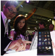
China Taps a Growing Phone Market