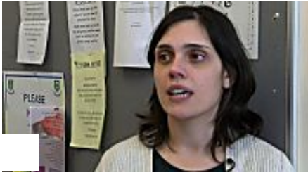
Calls to block plans to scrap Torfaen sixth forms