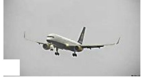
Storm Doris: Plane aborts landing in wind