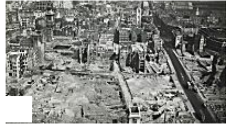
Haunting images of WW2 London's 'archive of destruction'