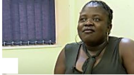
Steel firm unlocked disabled woman's potential