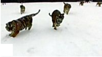
Siberian tiger knocks drone from the sky in China