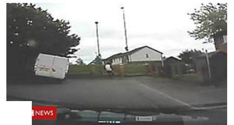
Police chase ex-footballer jumps from van