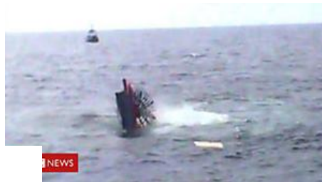
Moment paddle steamer sinks into sea