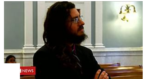
Evicted by his own parents, aged 30