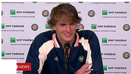
Tennis star struggles with Yorkshire accent