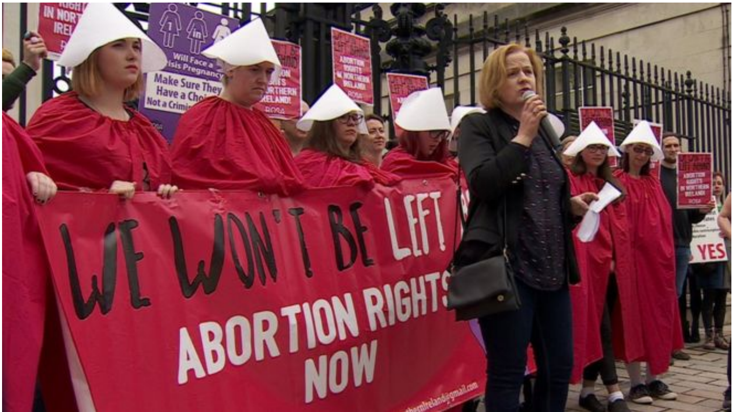
Pro-choice protesters outside Laganside Courts