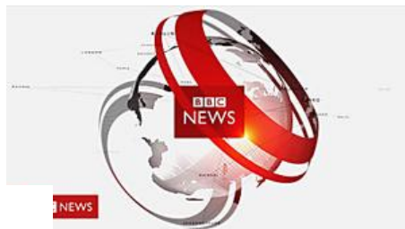
One-minute World News