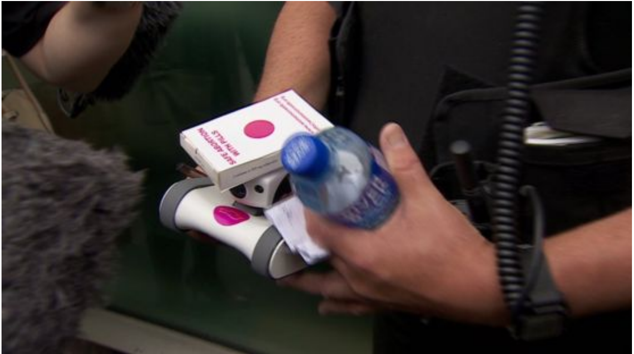
Abortion pills were handed over to police