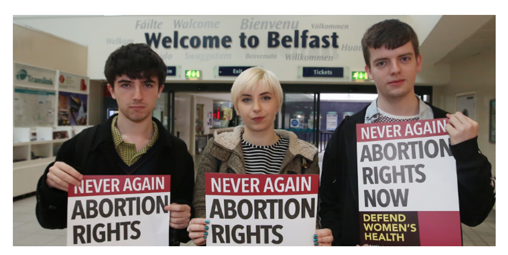
Pro-choice campaigners picking up abortion pills in Belfast, image source

Unlike legislation in place in mainland UK, Northern Ireland's abortion laws are far more restrictive. Although the procedure is allowed under very specific circumstances including cases where there is a severe risk to the mental or physical health of the mother, abortion – under the 1861 Offenses Against the Persons Act – is a crime. Outside of these criteria, women in Northern Ireland are encouraged to travel to England to avail of health services their own country denies them. Northern Irish women are not covered by the NHS for this procedure.