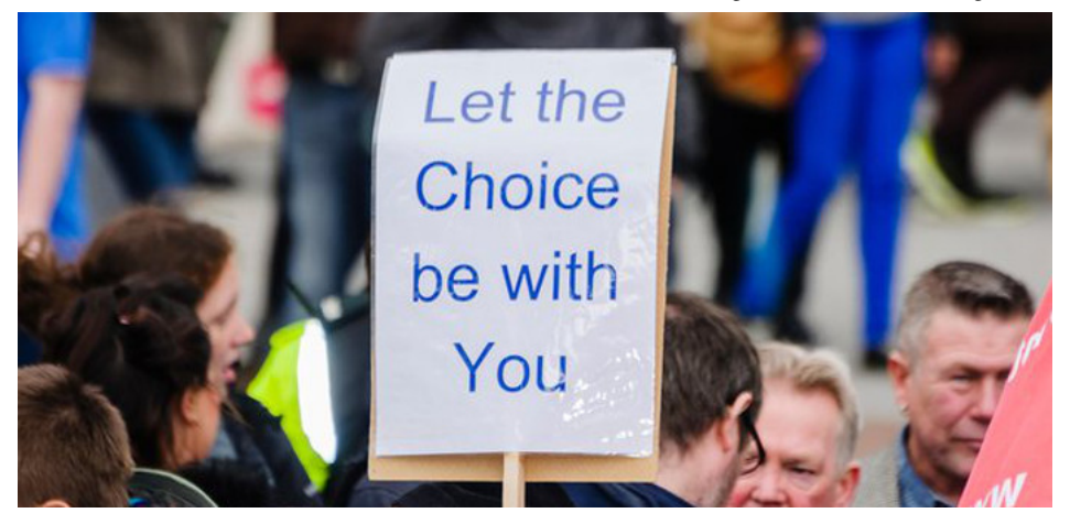
Pro-choice protest in Belfast last year, image source

Abortion Pills Case | Have Compassion for a Woman's Right to Choose - HeadStuff