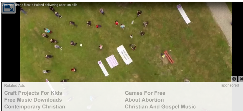
A view from a camera installed in the "abortion drone."

"The purpose of taking the pills is to show they are safe," Courtney Robinson, a spokeswoman for Labour Alternative, one of the four pro-choice groups involved in the protest, told Reuters.