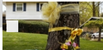
U.S. Drone Strike: Two Hostages Killed Accidentally