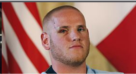
France train hero stabbed in California