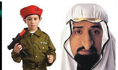
Arab-American group calls on Walmart to drop 'offensive' costumes