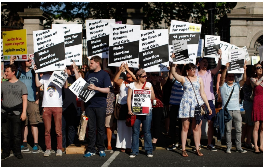
Abortion-rights supporters in front of the gates of the Irish parliament, in Dublin in 2013.

information about abortion services abroad and help women determine the best time and method for accessing clinics. Clients are asked to contribute as much as they can: In 2014 its average grant was 225 pounds