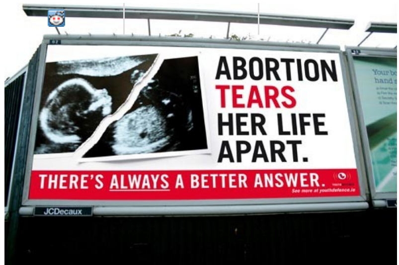
One of the anti-abortion billboards created by Youth Defence and the Life Institute.

Abortion rights have always been a difficult subject in Ireland, tangled in a web of competing interests and beliefs. In 1983, Ireland passed the Eighth Amendment to the Constitution, extending the right to life from a mother to her unborn child. This amendment, which effectively outlawed abortion in almost all instances, was directly