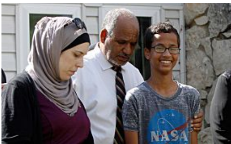
Texas teen arrested for homemade clock moving to Qatar