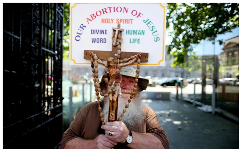
A demonstrator in Dublin before a 2013 parliamentary vote on abortion.

Over the last few years, as rallies and protests have become increasingly common on both sides of the abortion debate, a vision of Ireland shared by some anti-abortion activists has snapped into focus: Ireland as an anti-abortion success story