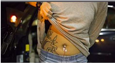
Los Angeles ends arrests of minors trafficked into sex trade