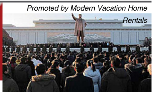
North Korea Revisited: An Unknown Land