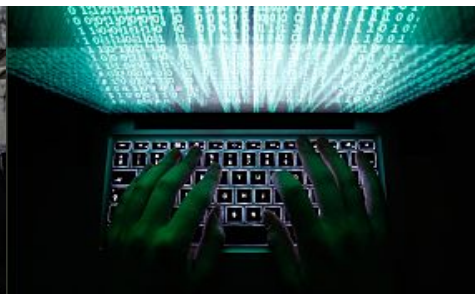
Senate passes bill to push sharing of information on hacker threats