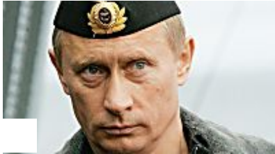
Ex-Nato boss: Don't let Putin get away with it