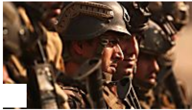
Mosul battle: Hidden dangers in the hunt for IS