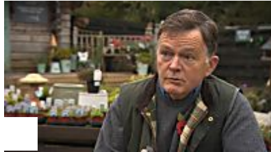
RAF Sentinel aircraft 'immune from ground targeting'