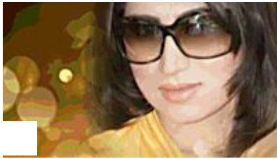
The naming and shaming of a sex symbol