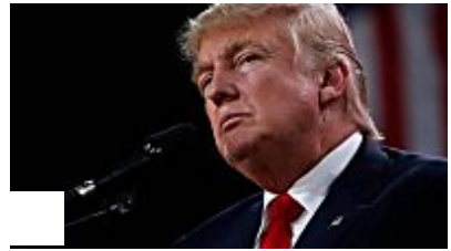
Assault allegations: 'Trump could be deposed'