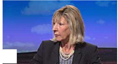
Wheatcroft and peers want Parliamentary vote on Brexit