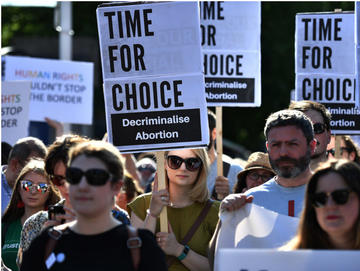
Activist group Solidarity with Repeal holds a rally calling for abortion rights outside Belfast City Hall last week in Belfast, Northern Ireland. The rally follows Ireland's vote to repeal a constitutional ban on abortion.