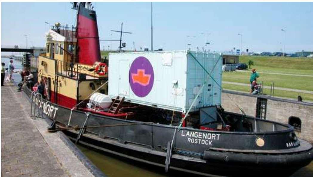
The Langenort during an earlier visit to Poland

The Dutch group Women on Waves is being refused entry in what is its first visit to a Muslim country.