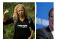
Facebook Apologizes for Censoring Pro-Family

( http://www.churchmilitant.com/news/article/la-wreck )