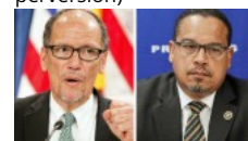
Democrat Party Headed by Two Faithless Catholics

( http://www.churchmilitant.com/news/article/cnn-anchor-chris-cuomo-attacked-for-defending-perversion )