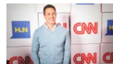
CNN Anchor Chris Cuomo Attacked for Defending Perversion

( HTTP://WWW.CHURCHMILITANT.COM/SEARCH/LATEST )