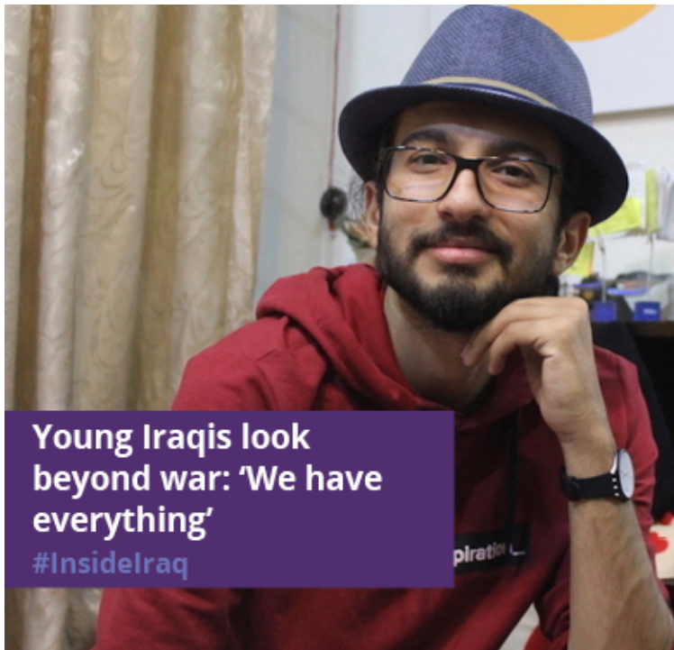
Young Iraqis look beyond war: 'We have everything' #InsideIraq

( http://www.middleeasteye.net/in-depth/features/cancer-baghdad-825379702 )