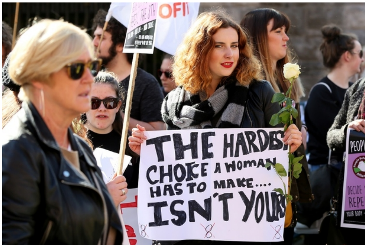
Protesters hold up placards as they take part in the March for Choice, calling for the legalising of abortion in Ireland after the referendum announcement, in Dublin on 30 September 2017

According to Justice Ministry figures ( http://jordantimes.com/news/local/gov%E2%80%99t-urged-draft-laws-allowing-abortion-cases-rape-incest ) released earlier this year, some 49 Jordanian women have been imprisoned for abortion between 2009 and 2016.