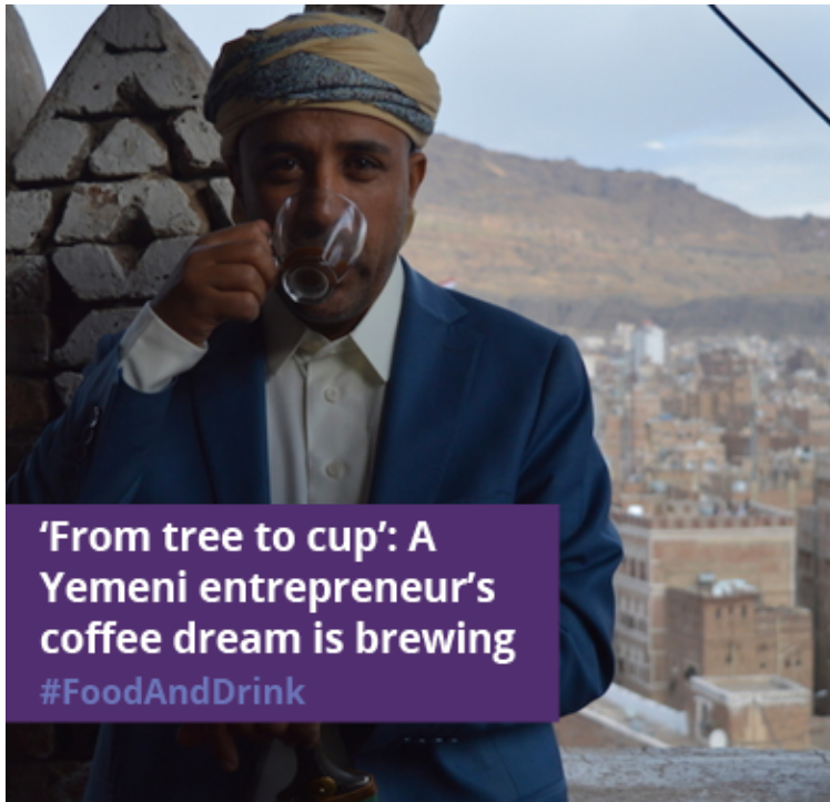
'From tree to cup': A Yemeni entrepreneur's coffee dream is brewing #FoodAndDrink

( http://www.middleeasteye.net/in-depth/features/coffee-pursuit-happiness-1527513534 )