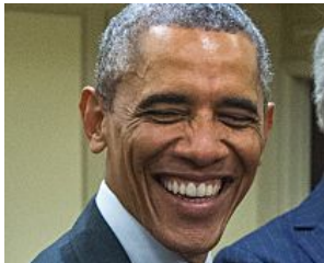
New Law Cracks Down on Right to Use Cash