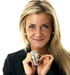
Experts Use This Trick to Pay Off Their Mortgage. It Might Surprise You! AmeriVALUE