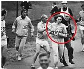
These Rarely Seen Historical Photos are Pretty Unnerving Buzzlamp