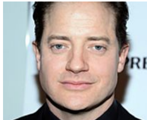
20 Stars Who Are Aging Terribly...#6 Will Make You Cringe! PressRoomVIP