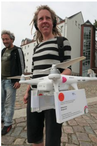
A drone is loaded up for flight.

The law was briefly liberalized in 1996 to allow for abortions on social grounds until the 12th week of pregnancy. But after that decision was ruled unconstitutional, the country reverted to its restrictive legislation.