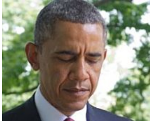
New U.S. Currency Law Now In Effect Stansberry Research