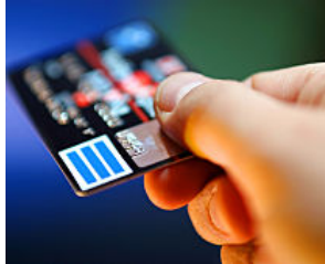
The Highest Paying Cash Back Credit Card Has Just Hit The Market NextAdvisor