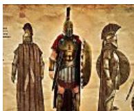
This Strategy game will keep you up all night! Sparta Online Game