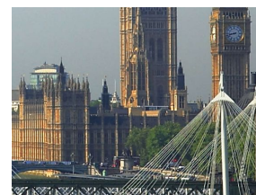
How Brexit is affecting the luxury property market in... Mansion Global