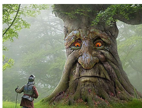
If you own a computer you must try this game Vikings