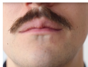
How Our App Teaches You A Language In 3... Babbel