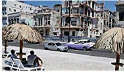
Americans saying adios to trips to Cuba?