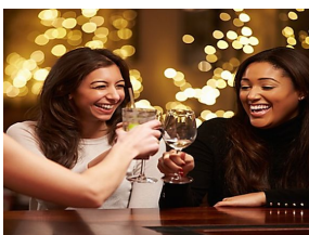
Ink48 Caters to Singles and Couples This... Global Traveler Magazine