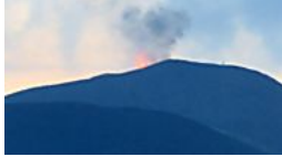
India's Barren Island volcano erupts, spews lava into air