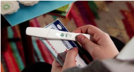
Each day an estimated five women in Ireland are using abortion pills bought online: Pro-choice group