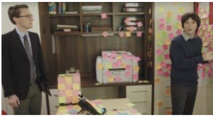
Cork comedy troupe unveil trailer for new RTÉ 2 show