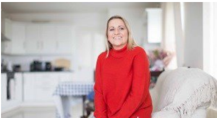
Seeing the bright side after going blind at 25