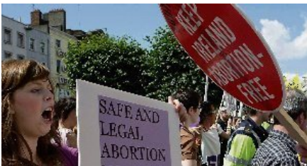
Oireachtas Committee on Eighth Amendment resumes today