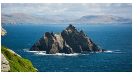
Quiz: Which film is this holiday destination from?