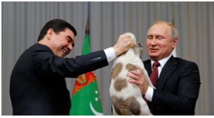
Vladimir Putin was given a puppy as a birthday gift and it was all totally normal