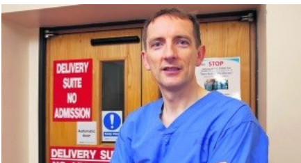
Rotunda Master before Eighth committee