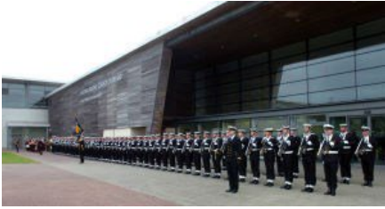
No prior warning of start-up hub closure