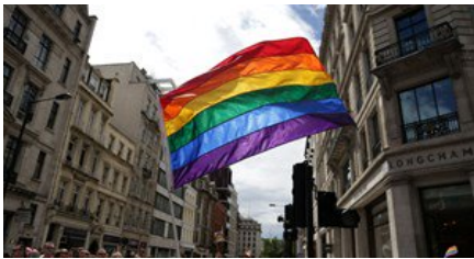
12 touching stories and inspiring words from National Coming Out Day