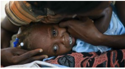
Sustained collaboration needed to wipe out cholera by 2030