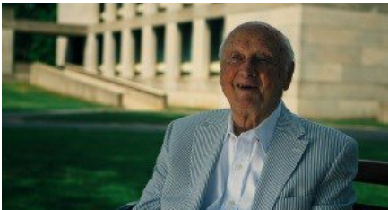
The Mitchelstown architect who went on to design iconic buildings in USA and Ireland