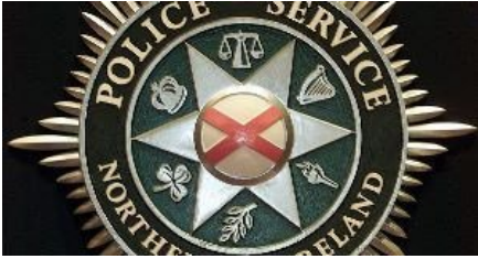
Fermanagh car crash being treated as a murder, say police