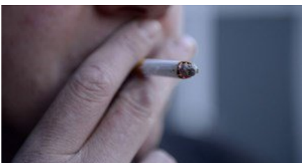
Cigarette butt found in bag of chips among 3,200 food safety complaints last year