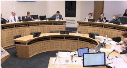
Committee hears abortion should be integrated into health system