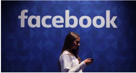
7 things you might be missing as Facebook and Instagram suffer global outages