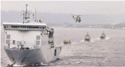
Navy considers €200m multi-role ship