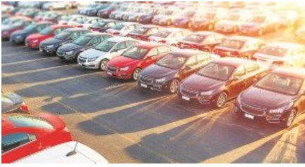
New car sales fall 10.3% this year