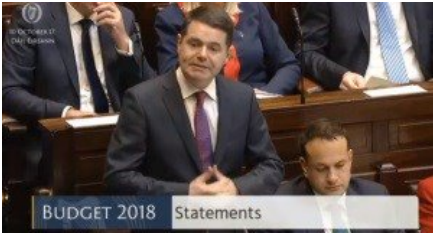
Government does not have cash to end 'bonkers' pension rule, admits Finance Minister