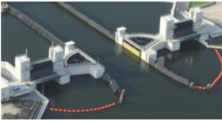
Cork City tidal barrier ruled out on cost basis