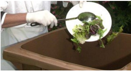
Over 3,200 food safety complaints lodged