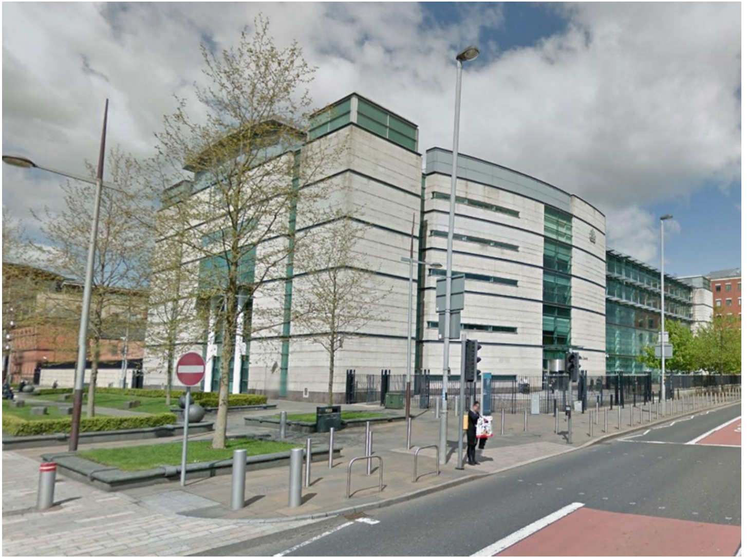
Laganside Courts Google maps

A woman has appeared in court in Northern Ireland charged with breaking the region's abortion ban.