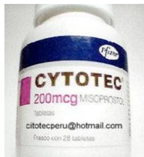
Misoprostol is often sold under the name Cytotec

One recent example comes from the Kigoma Region of Tanzania. Pro-abortion feminists boast that they have established a clinic dispensing the abortion-inducing drug misoprostol in this rural area, despite what one anonymous staff member called "the restricting legal context."