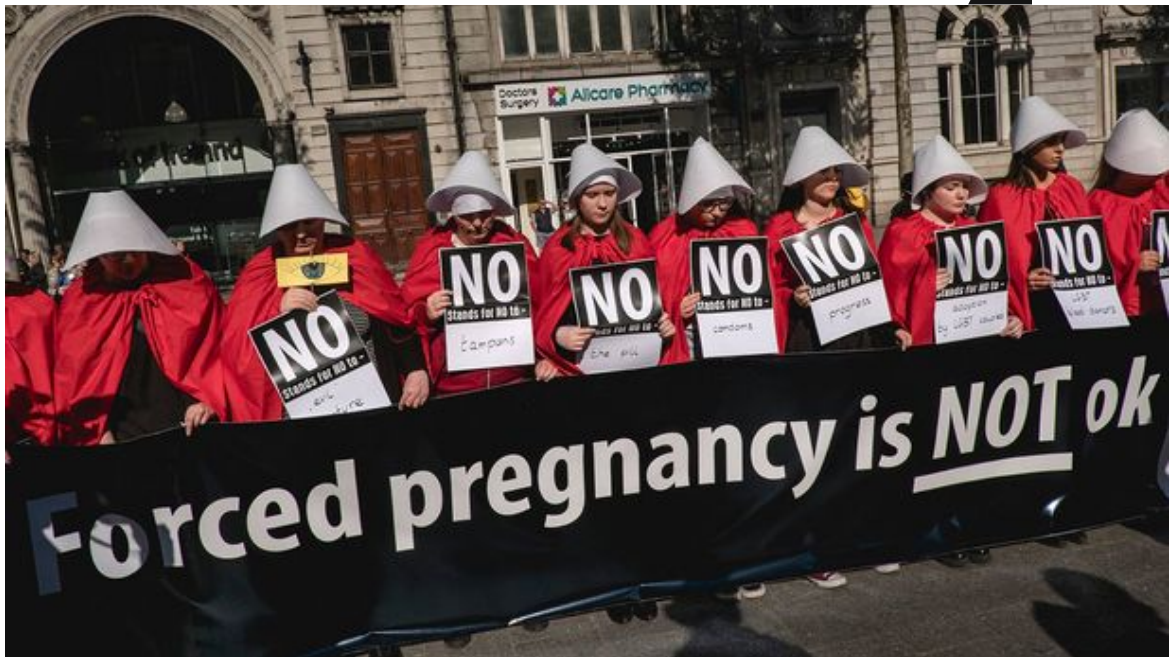
Activists dressed as handmaids

"Having an abortion ban doesn't stop abortions from taking place. It just stigmatises them and makes them more difficult.