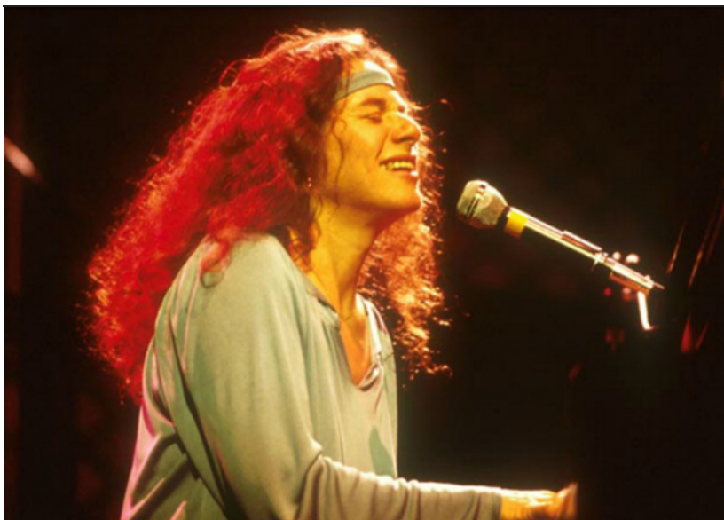
Carole King, 1971.

By the late 1960's the female contemporary singer/songwriter was a staple in mainstream music. Two such performers were Carly Simon and Carole King. Both hailed from the New York City area and wrote about the condition of women in their time with a clarity and honesty that connected with their audience. They presented themselves as women in charge on stage, accompanying themselves with either piano or guitar, no distractions. Their music was accessible, sincere, and radio-friendly in style and song length. They found their voice politically and socially.