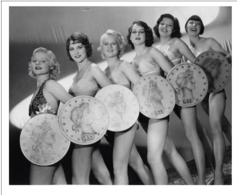
GOLD DIGGERS OF 1933.