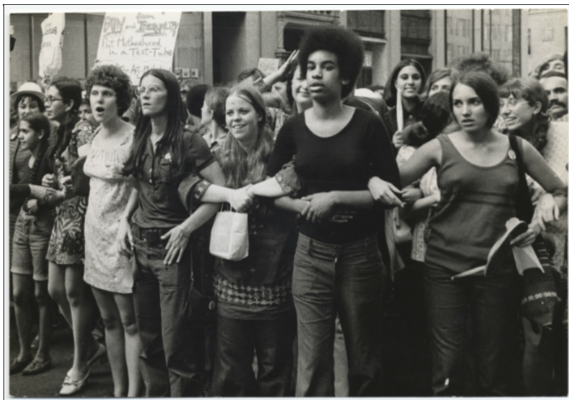
8-26-1970 march in She's Beautiful When She's Angry.