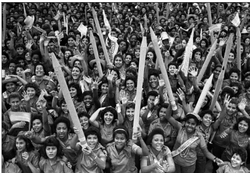
Maestra.