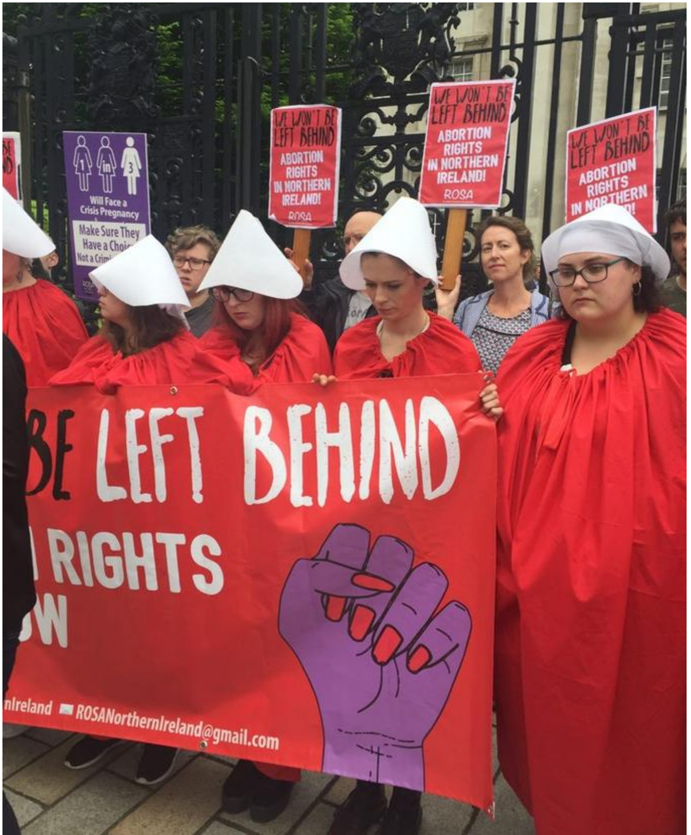
Pro-choice campaigners