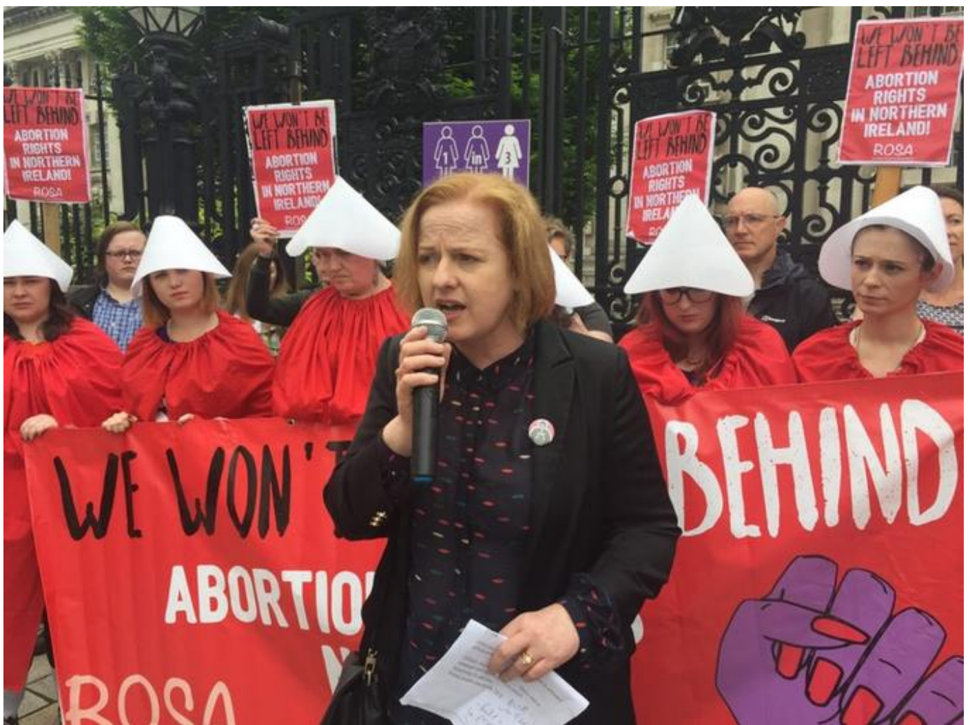
Ruth Coppinger Credit: Ruth Coppinger

Police Service of Northern Ireland (PSNI) officers moved in to seize some of the pills and the tiny robot, less than the size of an A4 page, which was used to distribute them.