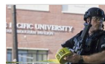
Takes Down Gunman In New 2014 Seattle Shooting