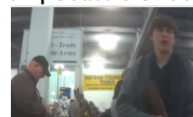
owns 13-Year-Old Buying Gun d Booze And Tobacco