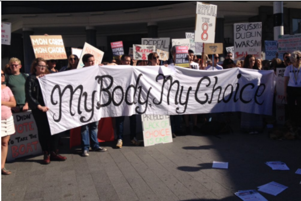
A rally in Brussels in support of the #repealthe8th movement

The eighth amendment to the Irish constitution, which was ratified in 1983, gives explicit recognition of “the right to life of the unborn” equal to that of its mother.