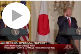
Trump 'did not use earpiece' for Japanese PM news conference