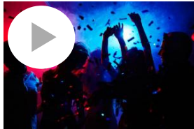
How to dance if you want to seem attractive, according to study