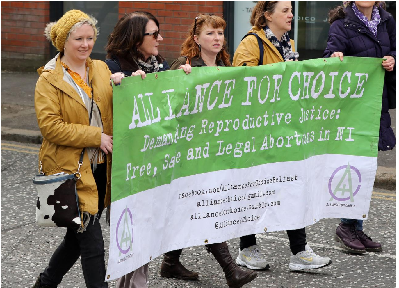
Pro-choice campaigners taking part in a demonstration through Belfast city centre in protest at Northern Ireland's restrictive abortion law

Britain's largest abortion provider has announced it will have to begin turning Irish women away from its clinics as it struggles to meet demand.