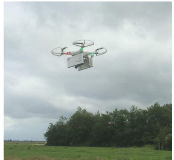
Women on Waves

German police did confiscate drone controllers and personal iPads from drone pilots. They have pressed criminal charges but on what grounds, is unclear. Women on Waves writes that “The medicines were provided on prescription by a doctor and both Poland and Germany are part of Schengen ” an area of 26 European countries which have collectively decided to