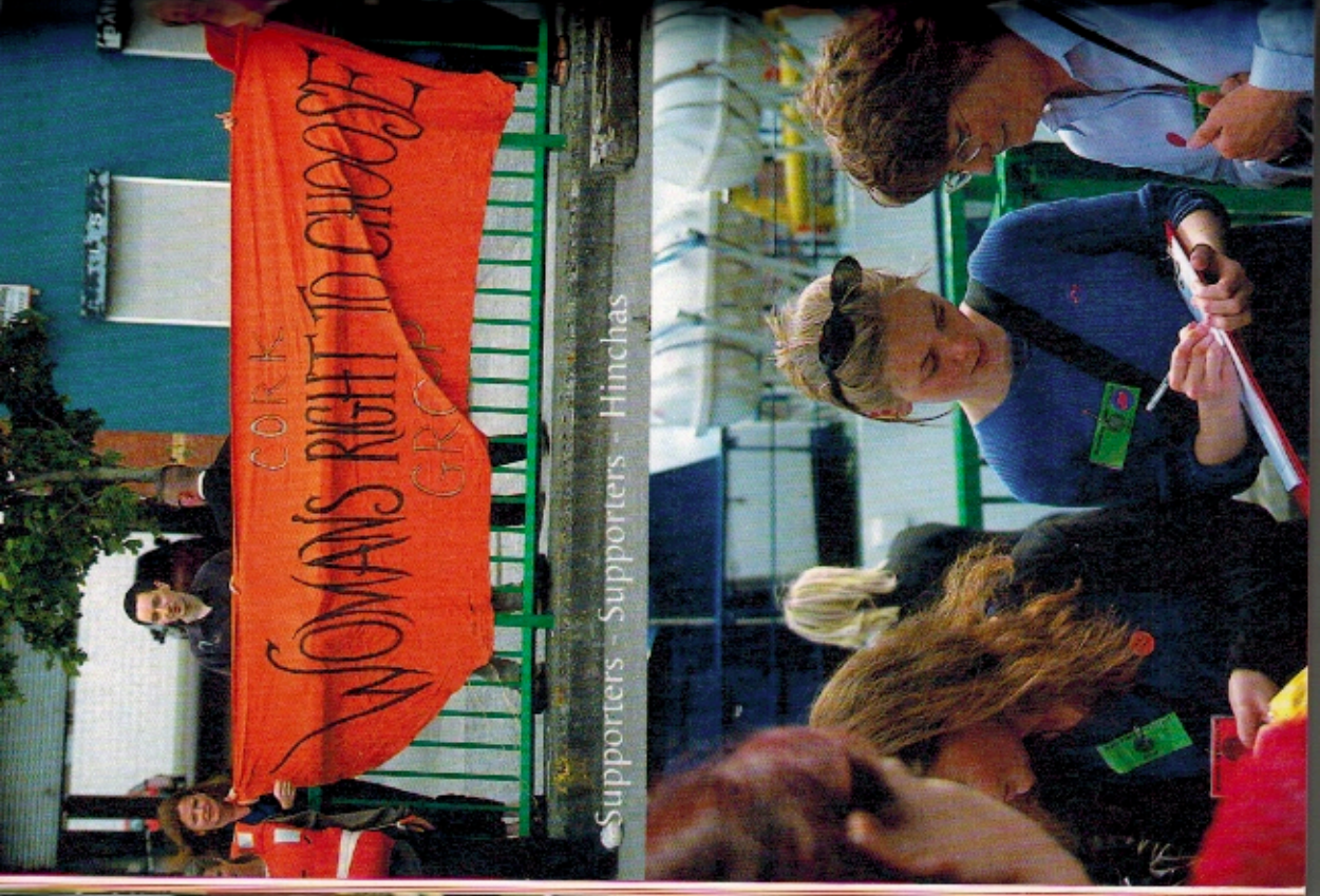
Supporters - Supporters - Hinchas