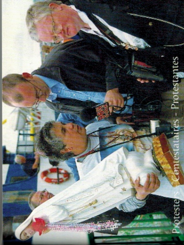
Protestes - Contestataires - Protestantes