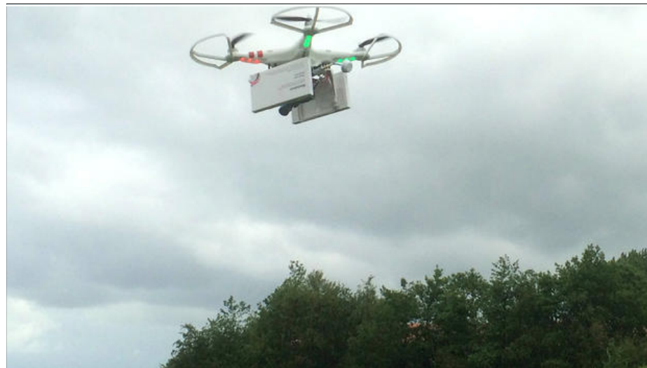
The so-called "Abortion Drone," an unmanned aerial vehicle carrying medical abortion pills, is tested by the Dutch women's rights group Women on Waves, in a handout photo.

25 Comments / 1 Shares / 14 Tweets / Stumble / Email More +