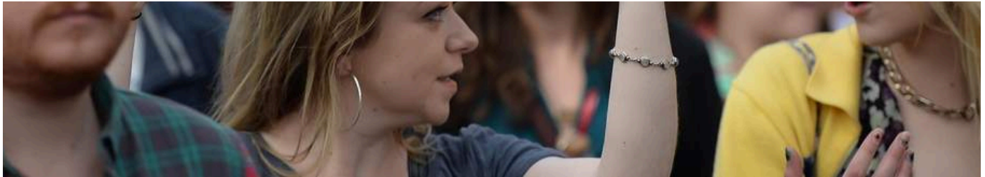
Protesters on the 'Annual March for Choice' in Dublin, Ireland in 2014

Derry is a city full of kindnesses. It is a city blessed with a culture of women helping women. But in 1966 there was an oppressive silence throughout the whole of Northern Ireland. The catalyst? Abortion.