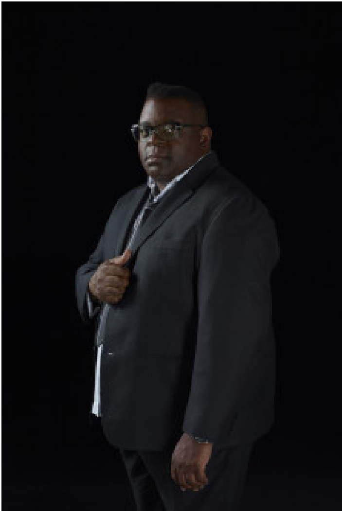
( http://moussomagazine.it/catherine-opie-portraits-landscapes-thomas-dane-gallery-london-2017/ )