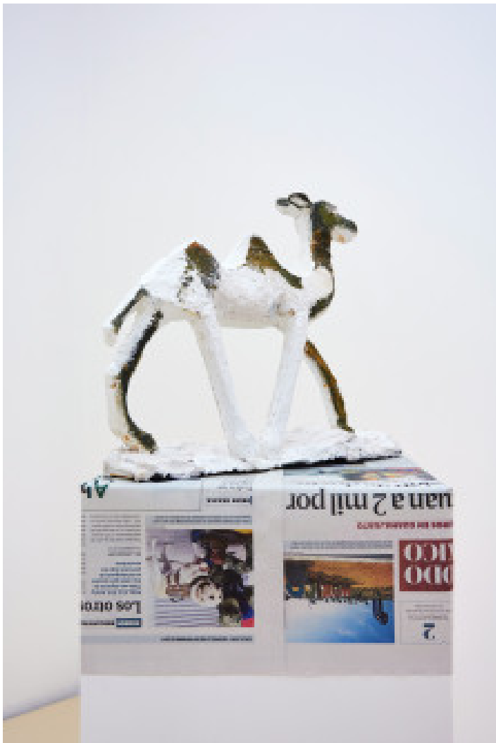
( http://moussmagazine.it/lin-may-saeed-lulu-mexico-city-2017/ )