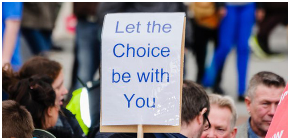
Pro-choice protest in Belfast last year, image source

Being pro-choice doesn't mean deciding when and where other women get to have abortions. It means accepting that you will never get to decide for anyone but yourself. It means being able to understand that individual circumstances differ, that not everyone is the same, and that everyone should have the right to choose what is best for their health, their bodies, and their minds. It means having compassion. It means not judging.