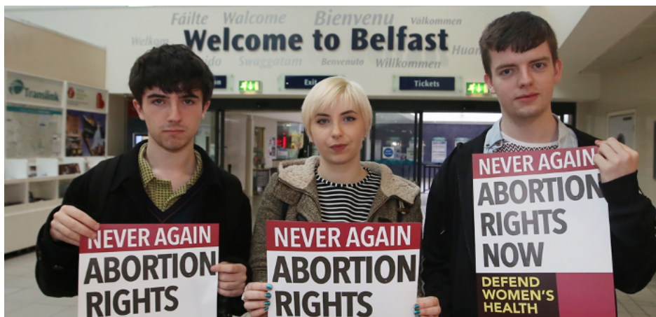
Pro-choice campaigners picking up abortion pills in Belfast

Unlike legislation in place in mainland UK, Northern Ireland's abortion laws are far more restrictive. Although the procedure is allowed under very specific circumstances including cases where there is a severe risk to the mental or physical health of the mother, abortion – under the 1861 Offences Against the Persons Act – is a crime. Outside of these criteria, women in Northern Ireland are encouraged to travel to England to avail of health services their own country denies them. Northern Irish women are not covered by the NHS for this procedure.