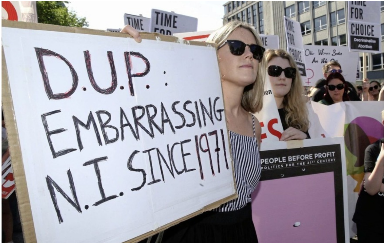
Time For Choice protest outside Belfast City Hall last night